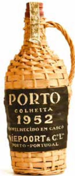
Niepoort Colheita Port 1952 0,75 l Douro 3 cm, Etikett ganz leicht verschmutzt, die Flasche ist in einem Korb eingeflochten, Füllstand nicht erkennbar und daher geschätzt