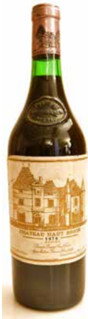
Chateau Haut-Brion 1978 0,75 l Pessac-Leognan, 1er Cru Classe

1,5 cm, Etikett beschädigt, stark verschmutzt