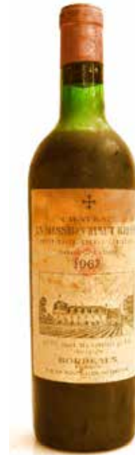
Chateau La Mission-Haut-Brion 1967 0,75 l Pessac-Leognan, Cru Classe

** Broadbent: "...guter Geschmack, etwas 'süß', mittelschwer..."