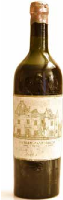
Chateau Haut-Brion 1909 0,75 l Pessac-Leognan, 1er Cru Classe

hs, Etikett beschädigt, verschmutzt, Kapsel beschädigt