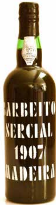
Barbeito Sercial Madeira 1907 0,75 l Madeira in