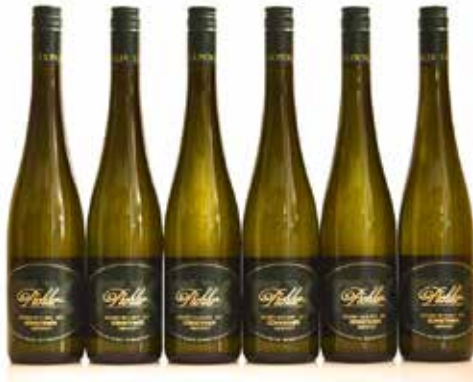
Pichler, F.X. Dürnsteiner Grüner Veltliner Smaragd 2017 0,75 l Wachau 0,5 cm